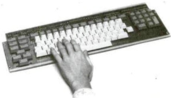
(Above) Key Tronic P2402-19 keyboard (Right) Digitran KD131 keyboard (Left) Closeup of the KD131's "capacitance in reverse" key